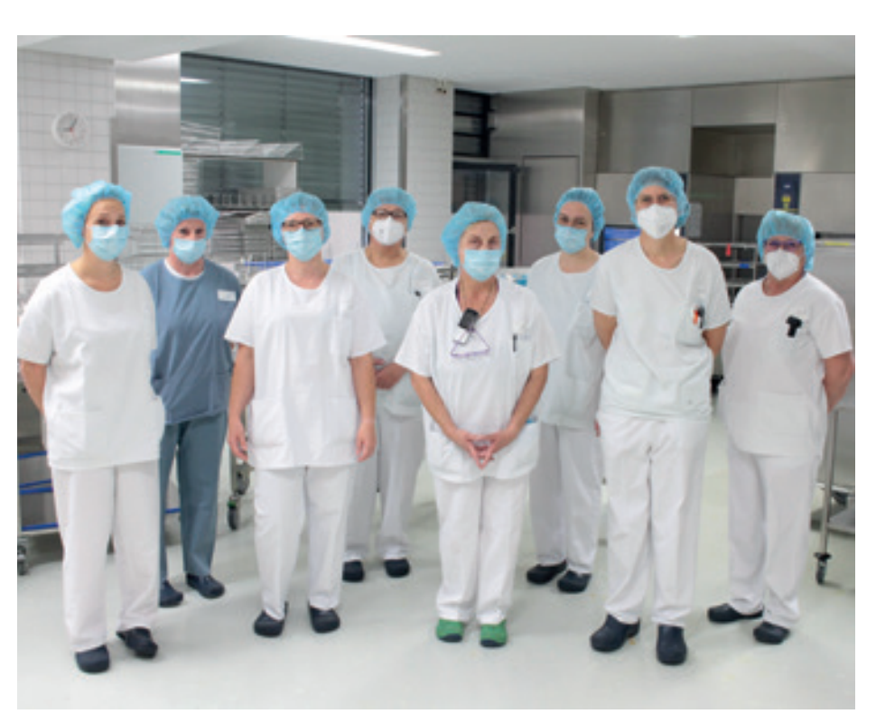
A strong team: the staff of the CSSD at Weiden Hospital.

Nevertheless, we are saving on the bottom line. The immense reduction in preand post-cleaning of more than 90%, the savings in chemical costs due to less use of the manual cleaning agents and the reduction in repair costs far outweighed these additional costs. And this doesn't even include the costs for the deep cleaning that was originally carried out on a quarterly basis! And there is another added value, namely the motivation of the employees, who are relieved of activities that are hazardous to personnel."